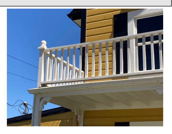
Figure 12- 2024 Balcony railing with expressed newel posts.