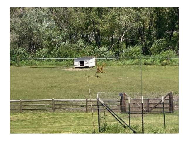
Figure 16- 2024 New Stable. Author photo