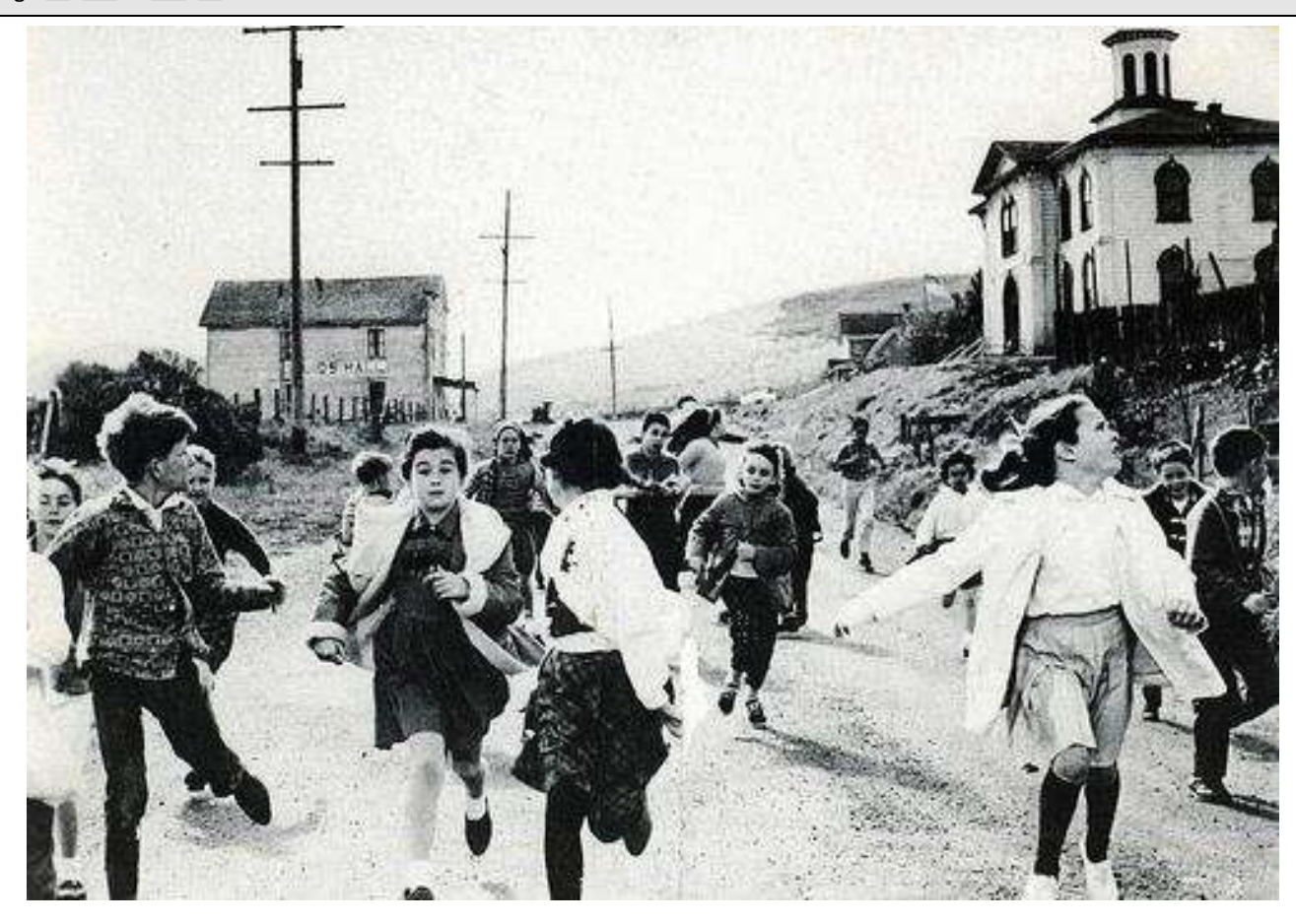
Figure 4- Image from Alfred Hitchcock's "The Birds" with 17132 Bodega Lane at left.

Source: "The Birds" (1963) http://www.imdb.com/title/tt0056869/triviav,