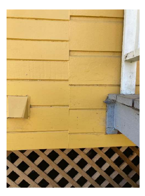
Figure 7- Siding transition, North Elev. Original on right. 2024, author photo.