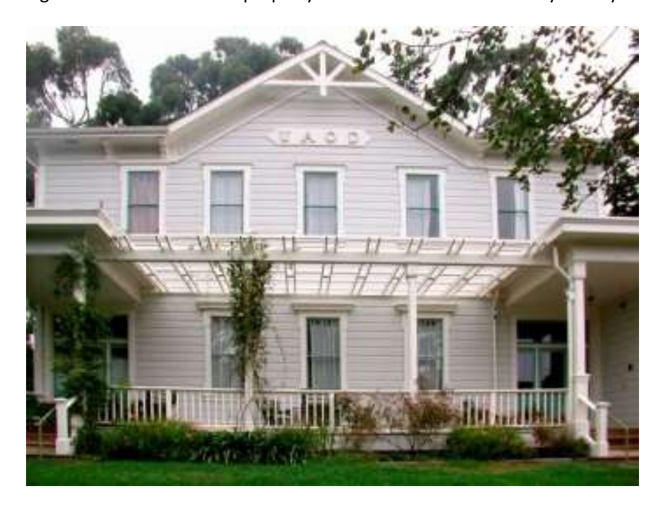
Figure 6- 2024 Druid's Hall, Olema.