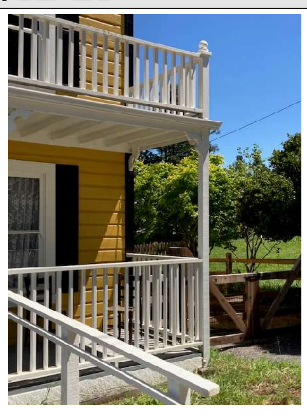
Figure 11- 2024 Balcony and Porch Railings. 2x2 square spindles with plain rails.