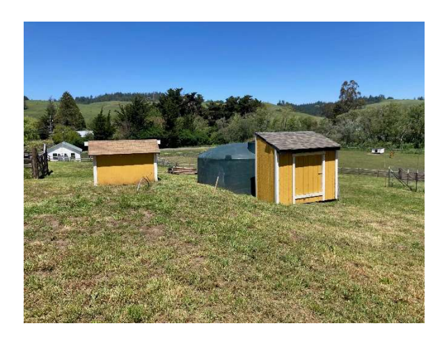
Figure 18- 2024 Sheds relocated to water tank area, (see 1983 view of the property)