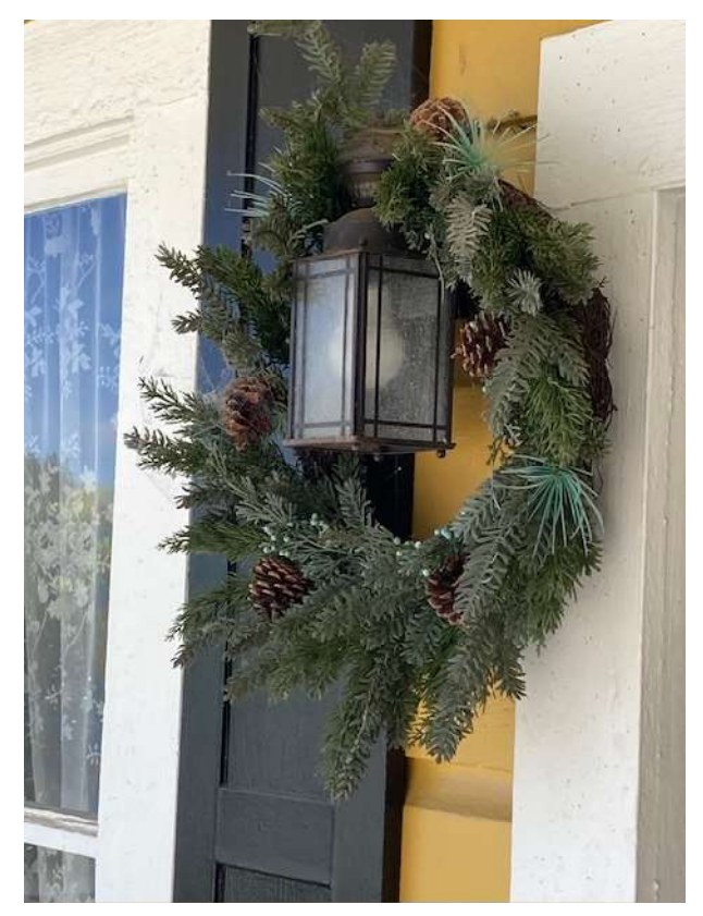
Figure 14- 2024 Current exterior lighting, west and north elevations.