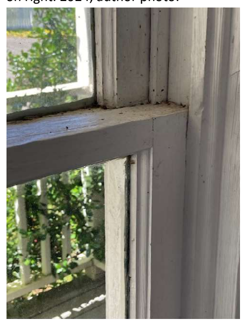
Figure 9- 2024 Existing 1 over 1 window condition.