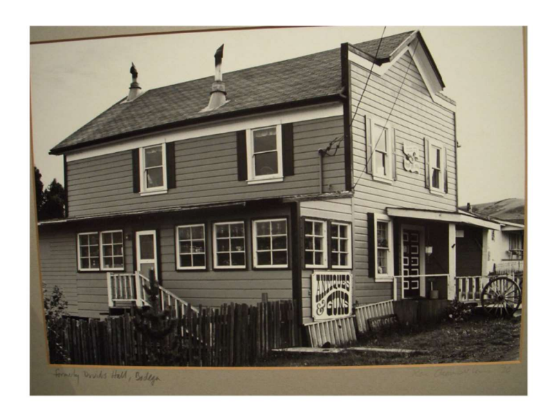
Figure 2- 1975 Image. View from NW. (above)