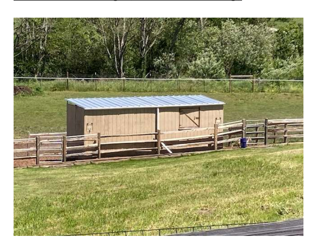
Figure 15-2024 New Stable.