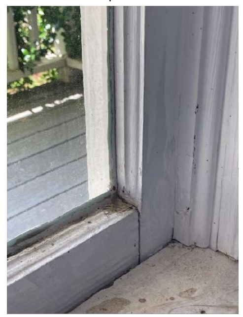
Figure 10- 2024 Existing 1 over 1 window condition. Author photo