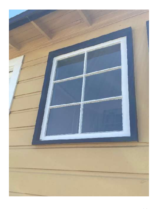
Figure 8- 2024 Second window type (fixed?) at Addition.