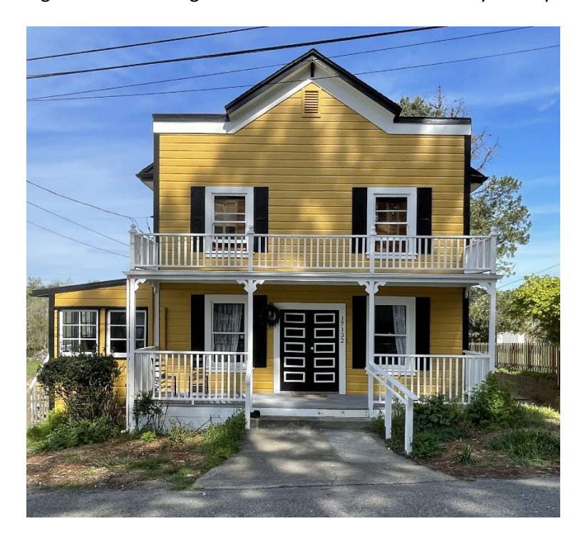
Figure 3- Current West Elevation (above)