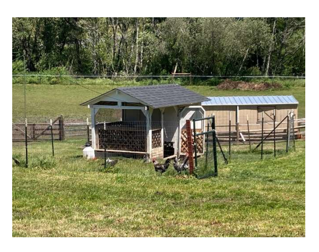
Figure 17- 2024 New Chicken Coop.